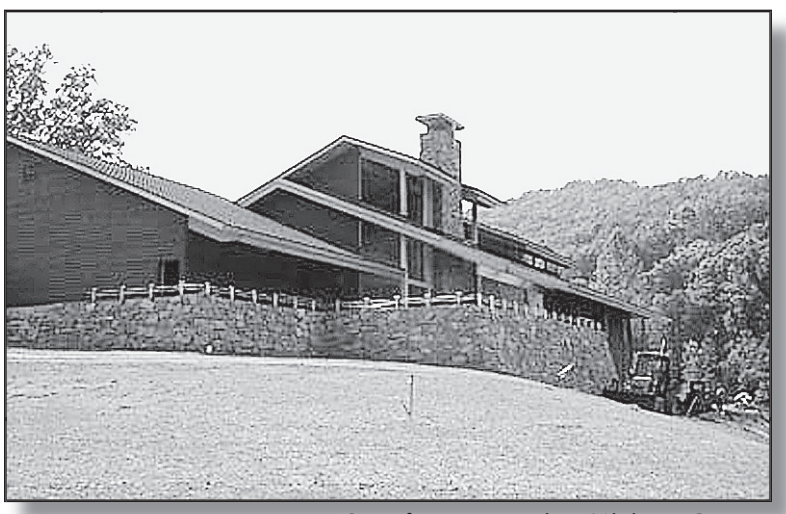
South Mountains Visitor Center

Development of land which is now in the South Mountains State Park began in the 1930s in Enola when Camp Dryer, a Civilian Conservation Corps (CCC) Camp was established to construct forest service roads, clean stream beds, and build a forest observation tower. The lower and upper CCC roads are still in use at the park. Although proposals for the park began in the 1940s, it was not until 1974 that funds were appropriated for the first